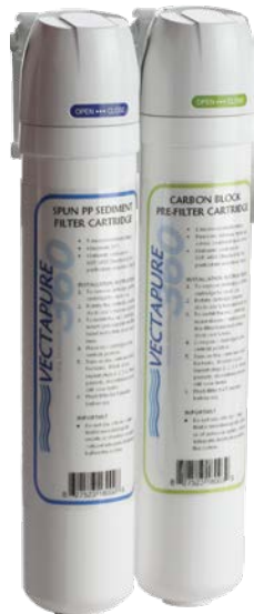
Dual Stage Filter System Sediment and CBC V3602SC