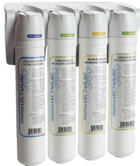
Four Stage 75 GPD RO System Includes tank and accessories V3604RO and V3604RONX*