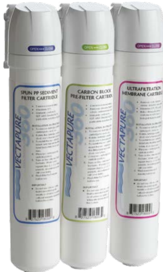
Triple Stage Ultrafiltration System Zero waste and no tank required V3603UF